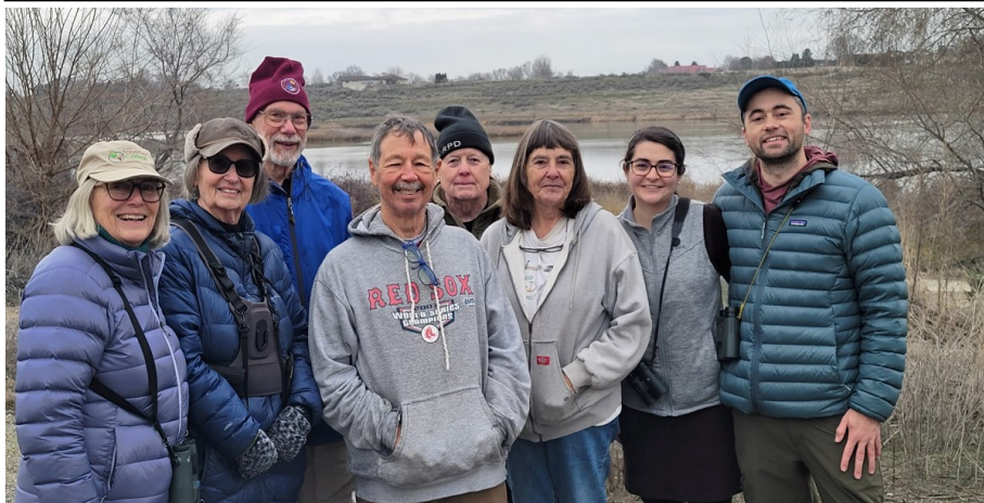
Leucistic White-crowned Sparrow, above Members of the banding team, below.