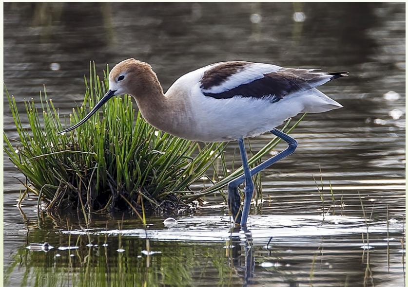
American Avocet in breeding plumage

In the locust grove, we came upon a flock of GOLDEN-CROWNED and RUBY-CROWNED KINGLETS showing off at eye-level rather than high in the treetops. Plenty of YELLOW-RUMPED WARBLERS, BEWICK'S WRENS, SONG and WHITE-CROWNED SPARROWS and DARK-EYED JUNCOS were seen all along the trail. We got a brief glimpse of a HERMIT THRUSH and heard a MARSH WREN. A few raptors made the list including AMERICAN KESTREL, BALD EAGLE, RED-TAILED HAWK and a slightly damp COOPER'S HAWK perched with tail and wings spread to dry the feathers.