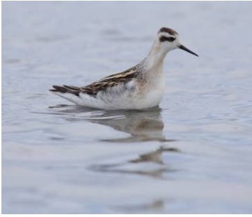
"Red-necked Phalarope"

It was a gorgeous day for a bird walk on Bateman Island. About a dozen people scoured the area and came up with 58 species (at least). The number would have been well over 60 if we had spotted some of the common birds expected at this time of year. Some ducks are about including GREEN-WINGED TEAL, NORTHERN SHOVELER, AMERICAN WIGEON and NORTHERN PINTAIL. A couple of small patches of mud in the delta had WESTERN SANDPIPER, BLACK-NECKED STILT, SPOTTED SANDPIPER, LESSER YELLOWLEGS, and RED-NECKED PHALAROPE which was fun to see. They spin around one way, then the other like a compass gone wild.